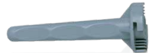
Twist-and-lock universal handle