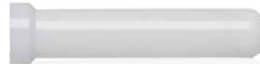
14 x 3cm (5½ x 1¼")